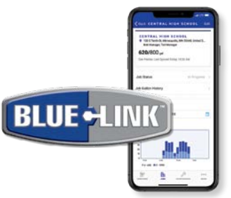
Know Job Progress

695 XT-1095 XT ProContractor Series SmartDisplay XT Included