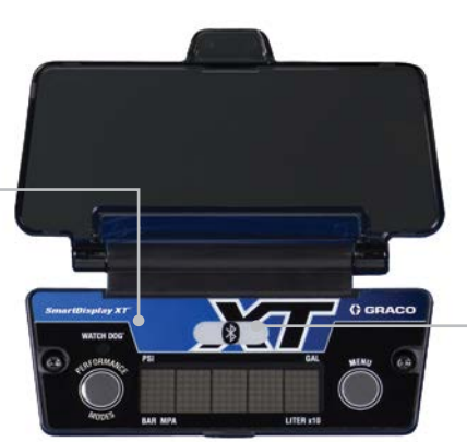
SmartDisplay XT 20B432