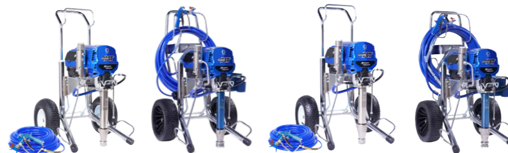
Mark VII XT™ ProContractor Series 19F744

BREAKTHROUGH FEATURES ACROSS THE ENTIRE XT LINEUP