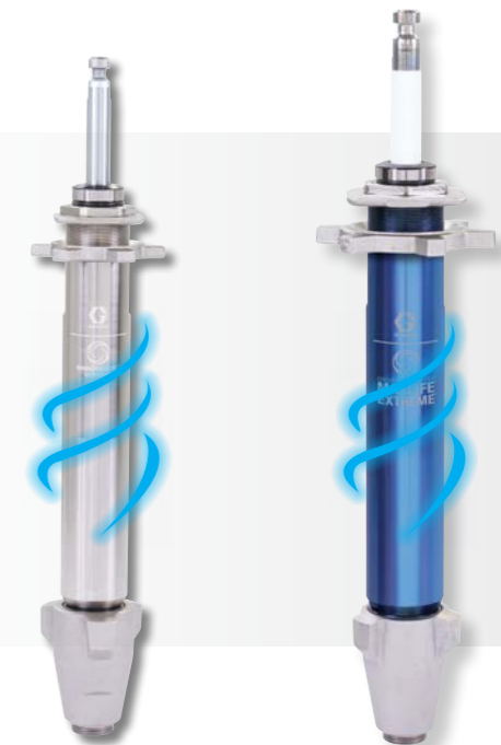
Endurance Vortex Chromex™ Pump Lasts 3X longer than competing pumps