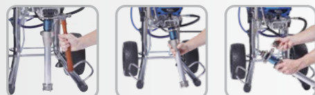
Loosen the Clamping Nut